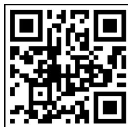
NG tube video QR code to youtube