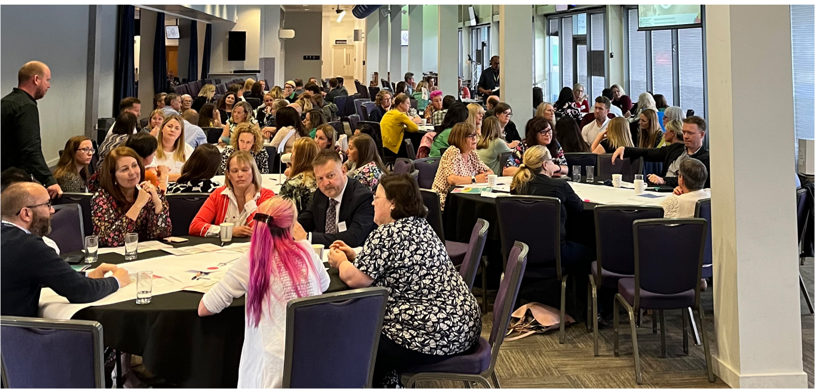
Image: Strategic Pharmacy Workforce Plan Launch Event, Cardiff City Stadium

We have already received 61 written pledges that people will continue to work with us during implementation of the 31 Actions. The benefits of implementing the plan are to safeguard high quality care for people taking medicines, provide a sustainable pharmacy workforce and ensure prudent use of medicines across all our NHS Wales organisations and service providers.