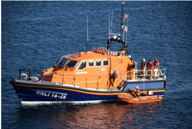
Life boat training

The Medical Education department consists of 6 members of staff who have created an educational environment that nurtures and develops doctors for the future. We deliver quality training standards by harmonising service and teaching to maximise all the educational opportunities within the clinical setting. We have a culture at Withybush of educators supporting and developing doctors as trainers and provide continual professional development opportunities to all of our doctors and dentists.